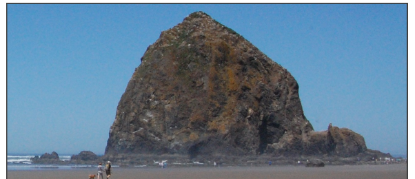
Iconic Haystack Rock, Cannon Beach, Oregon.

Clatsop County is an Affirmative Action/Equal Opportunity Employer.