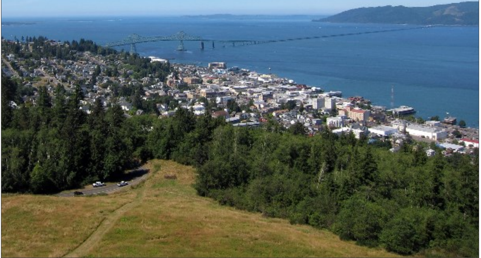
Astoria and the Astoria/Megler Bridge viewed from the top of the Astoria Column.