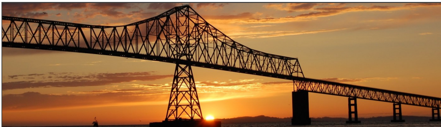
The Astoria/Megler bridge and a signature sunset.